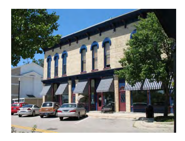
8695 Ferry, Montague Arts Council of White Lake