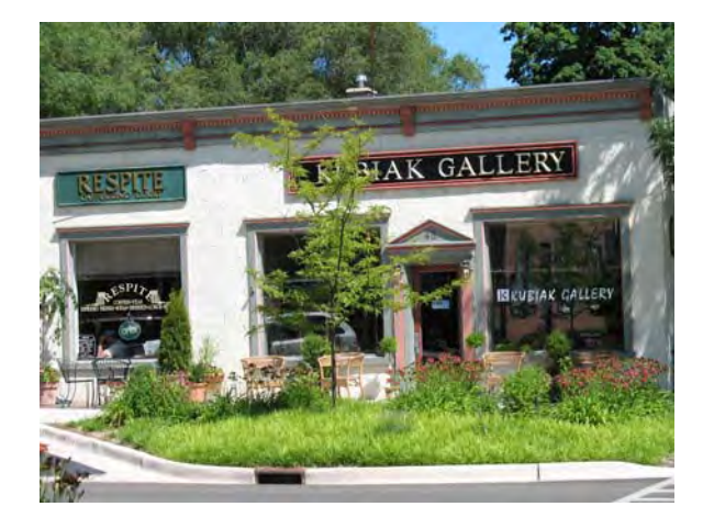
38 Center Avenue, Douglas Respite Cappucino Café