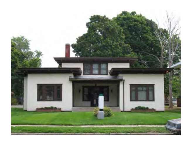
1516 Peck Street, Muskegon Michigan Works

A Prairie-style house and adjacent apartment building.