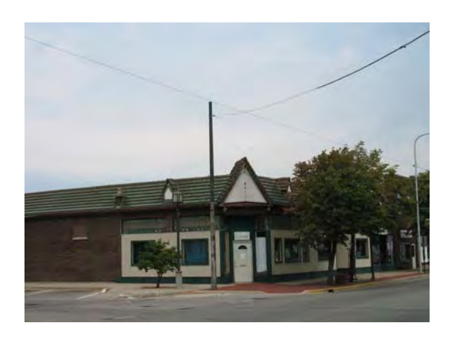
2731 Peck Street, Muskegon Heights Hope Lighthouse