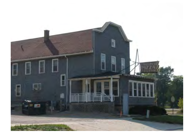
1400 Fulton Street Fricano's Pizza Tavern

The Coast Guard lifesaving station opened at Grand Haven in 1977. A second station was opened in 1922.