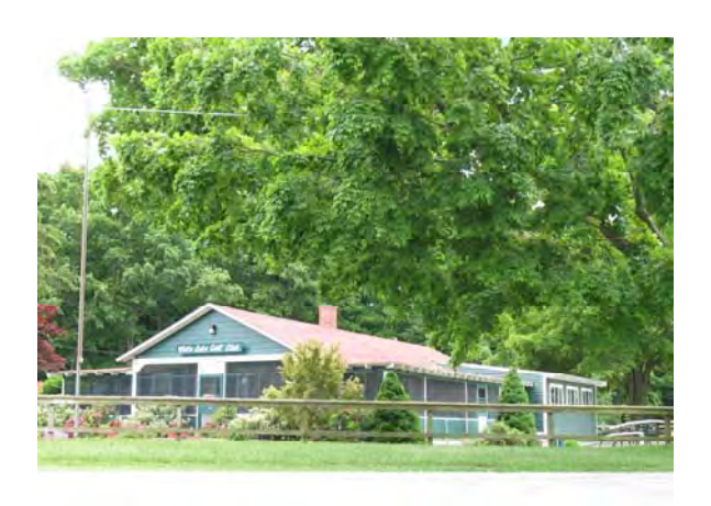
6777 South Shore Drive, Whitehall White Lake Golf Club

Established in 1916, the original course was designed by E. E. Roberts.