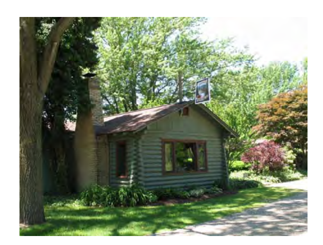
2790 Blue Star Highway, Saugatuck Hunter's Lodge