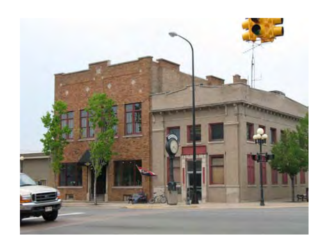
102 W. Colby, Whitehall State Bank Building (right)