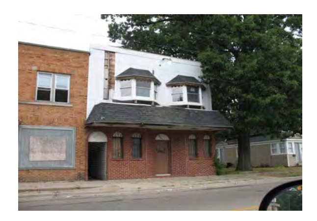
2927 Peck Street, Muskegon Heights Commercial Building