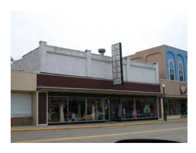
107 E. Colby, Whitehall Colby's Designer Outlet