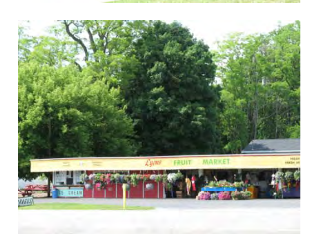
6821 124 <sup>th</sup> Street, Saugatuck Lyon's Fruit Market