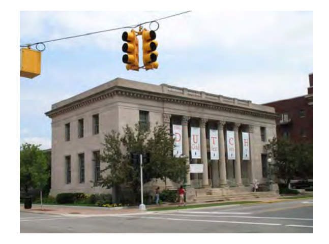
31 West Tenth Street, Holland Holland Museum

The building was originally the post office built in 1914. The museum collection includes paintings by Dutch masters.