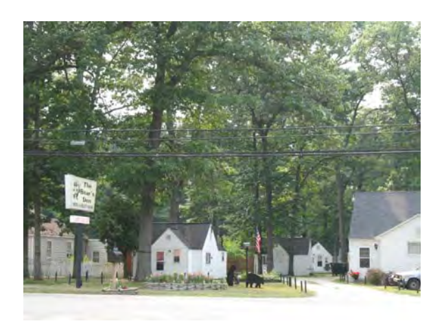
2165 Whitehall Road, Whitehall Bear's Den Motel