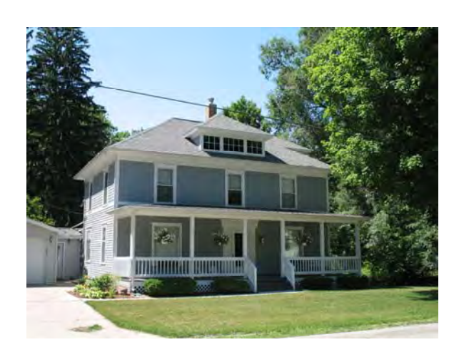
115 Main Street, Whitehall Swedentown Boarding House

In the late 1870s a large contingent of Swedes came to Whitehall to work in the village's lumber mill and tannery. By 1882 over seven hundred Swedes had settled in the White Lake area. In Whitehall the area roughly bounded by Main, Johannah and Johnson Streets became known as Swedentown.