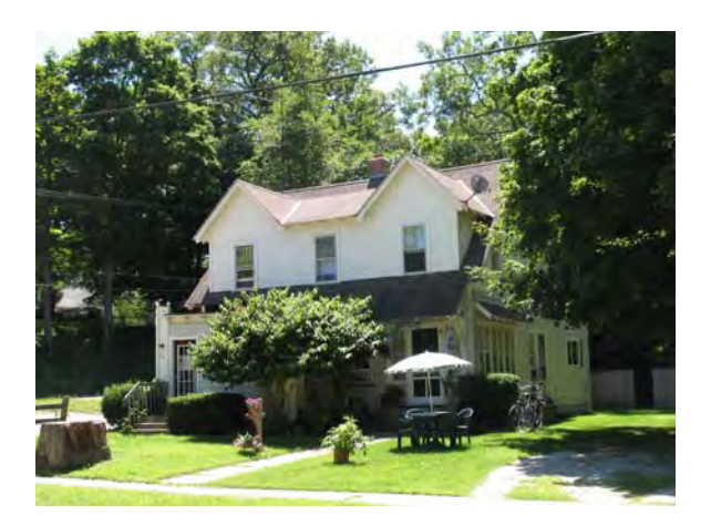
237 Francis, Saugatuck Residence

Built in 1940 it was originally an an apartment house