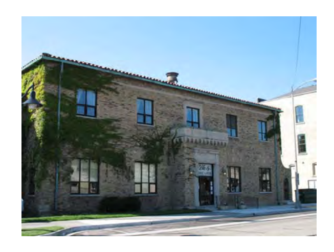
15 S. Third, Grand Haven Elks Lodge 200