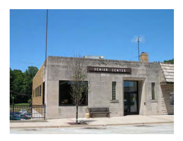
8741 Ferry, Montague White Lake Senior Center