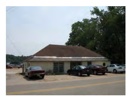
Ottawa Beach Boat House