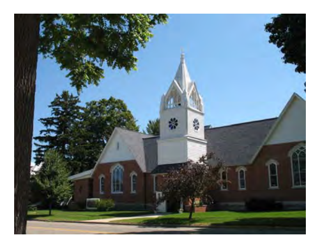
1101 S. Mears, Whitehall Swedish Lebanon Lutheran Church

A group of Danes, Swedes and Norwegians who came to Whitehall to work in the lumber industry and tannery organized the Scandinavian Lutheran congregation in 1872. The Swedes later withdrew to join the Augustana Synod and in 1877 built the Swedish Evangelical Lutheran Lebanon Church of Whitehall.