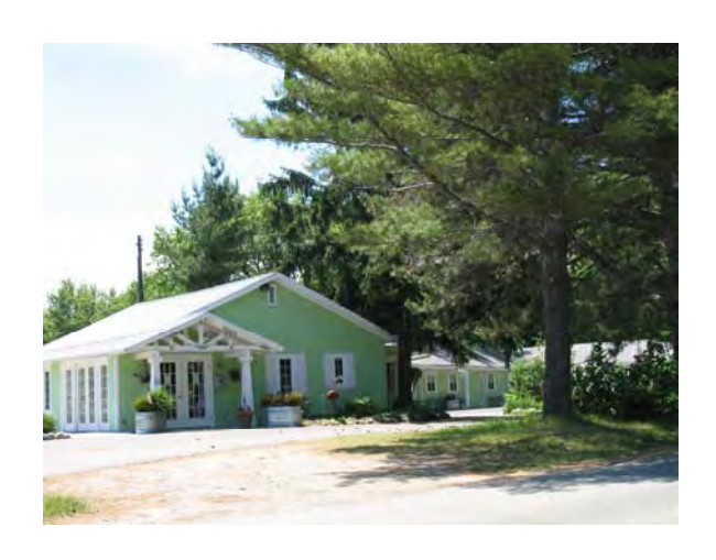
58 Blue Star Highway, Douglas Pines Motor Lodge

Originally the Plaza Tourist Court, a 1950s era motel with little decoration, the motel was completely remodeled in 2004 to reflect the Arts and Crafts style.