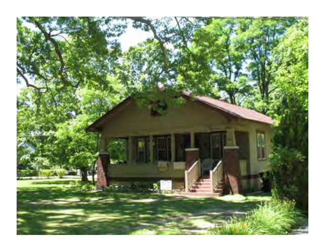
612 Holland Street, Saugatuck Residence