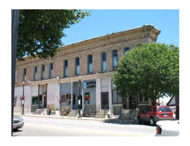
4586 Dowling, Montague Montague Antique Mall

Two music teachers from the University of Illinois-Champaign created the Dog 'n Suds drive-in restaurant chain in 1953. The business was an overnight success and by the 1970s there were over six hundred Dog 'n Suds franchises located in thirty-eight states. Today only sixteen Dog 'n Suds locations are still in operation—two are in Michigan. The proprietor of Montague's Dog 'n Suds also owns the drive-in on Grand Haven Road in Ottawa County.