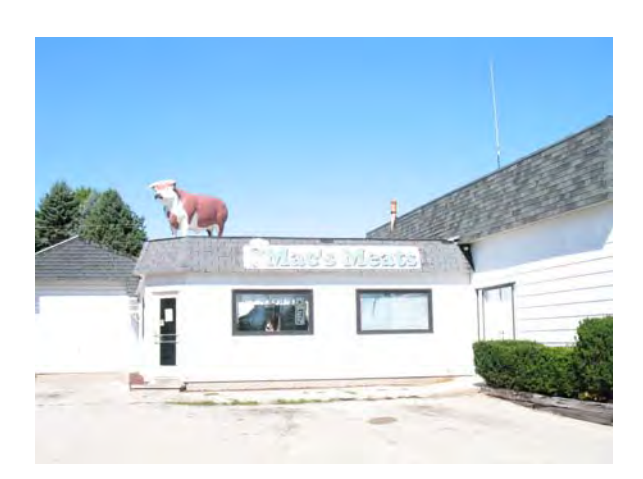
6309 Oceana Drive, Rothbury Mac's Meats

This local meat market was established around 1950.