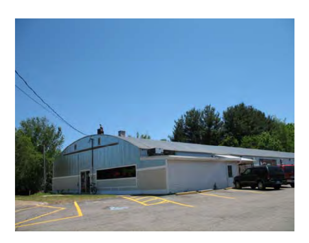
2948 Blue Star Highway, Douglas Blue Star Antique Pavilion