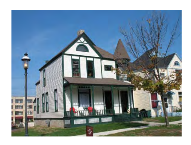
504 W. Clay Street, Muskegon Scolnik House Museum

Sherman Bowling Center opened in August 1958 with twenty-eight lanes; twenty-two more lanes were added in 1960.