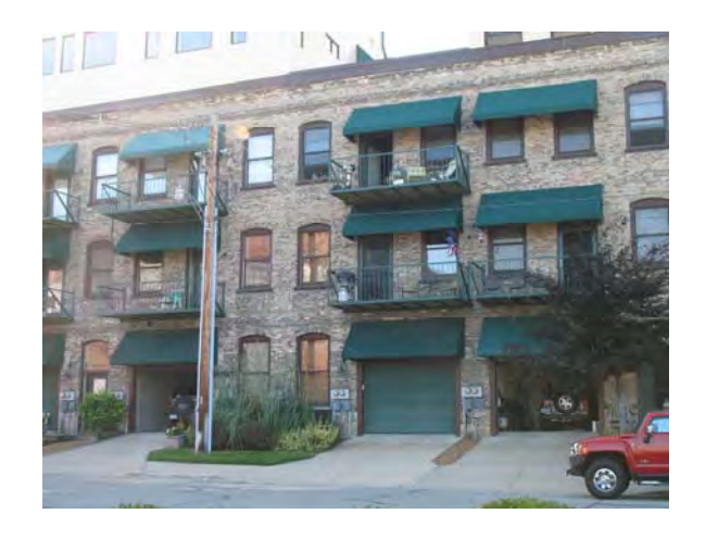
N. Harbor, Grand Haven Story & Clark Piano Factory