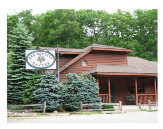
2998 Scenic Drive, Muskegon Red Rooster Tavern

The farmhouse and two six-room motel units, located just north of Pioneer County Park, are reminders of how tourism and the construction of the highway changed the economy of Muskegon County. The current owner replaced the asphalt roof with tin to preserve the resource. He is interested in rehabilitating the buildings.