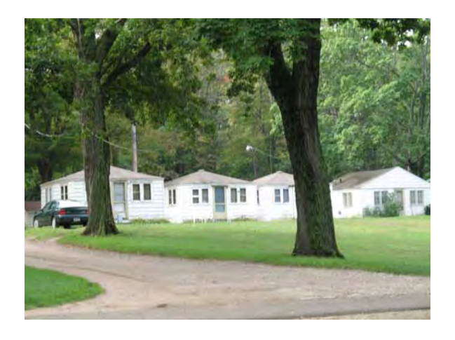
1516 S. Shore Drive, Holland Sunny Brook Cottages

Though completely altered inside and out, this local restaurant has been on the same site since the 1920s. Photographs of the original diner decorate the interior of the restaurant.