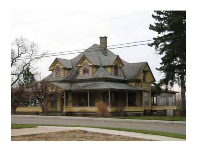
Old Channel Trail, Montague Queen Anne Cottage