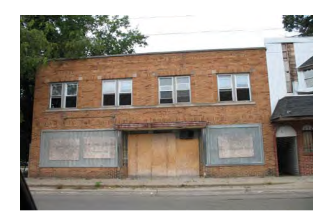
Peck Street, Muskegon Heights Commercial Building

this unprecedented success, the Muskegon Improvement Company decided to hold a second sale, this time building six model homes on existing lots to increase consumer interest.