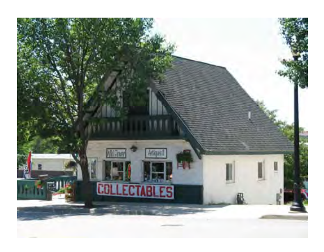
Dowling, Montague Wildflower Antiques II