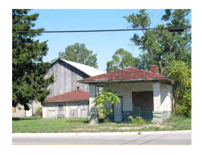
Grand Haven Road, Grand Haven 1920s Gas Station and Farm Buildings