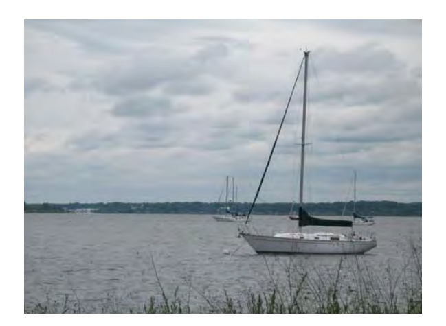
6806 South Shore Drive, Whitehall South Shore Marina