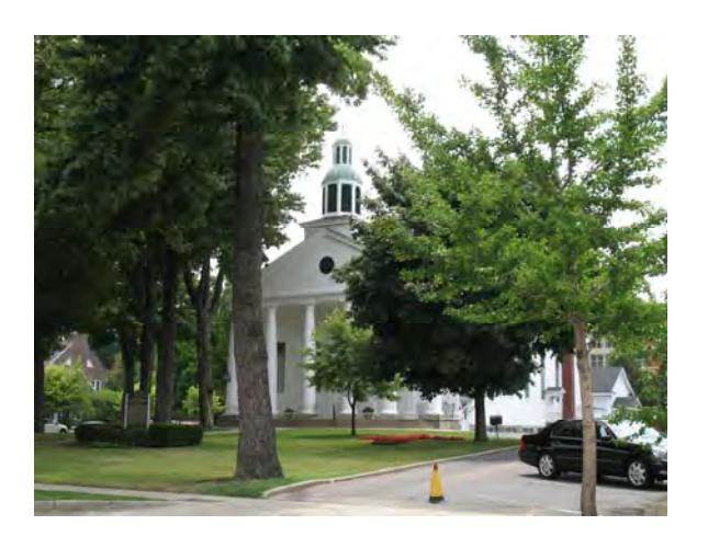
57 East Tenth, Holland Pillar Church

This Greek Revival style church was built in 1857 and is one of the few buildings in Holland to survive the fire of 1871. It is listed on the National Register of Historic Places.