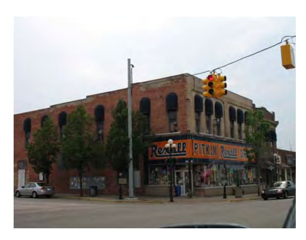
101 W. Colby, Whitehall Pitkin Rexall Drug