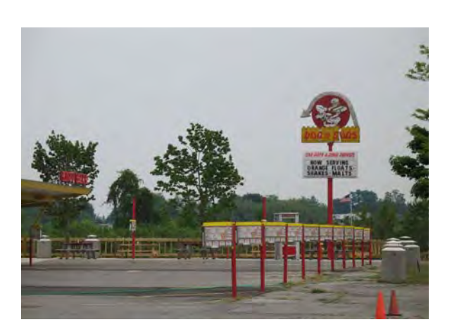
4454 Dowling, Montague Dog 'n Suds

Two music teachers from the University of Illinois-Champaign created the Dog 'n Suds drive-in restaurant chain in 1953. The business was an overnight success and by the 1970s there were over six hundred Dog 'n Suds franchises located in thirty-eight states. Today only sixteen Dog 'n Suds locations are still in operation—two are in Michigan. The proprietor of Montague's Dog 'n Suds also owns the drive-in on Grand Haven Road in Ottawa County.