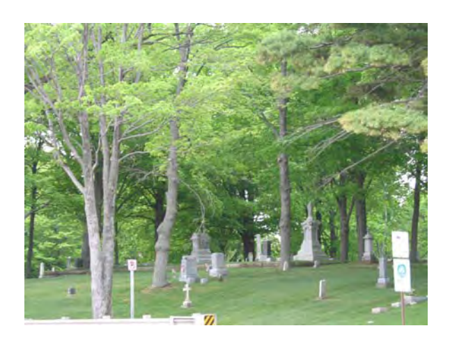
1300 Block Colby, Whitehall Oakhurst Cemetery

Ruth Thompson, the first woman elected to the United States House of Representatives, was buried here in 1970.