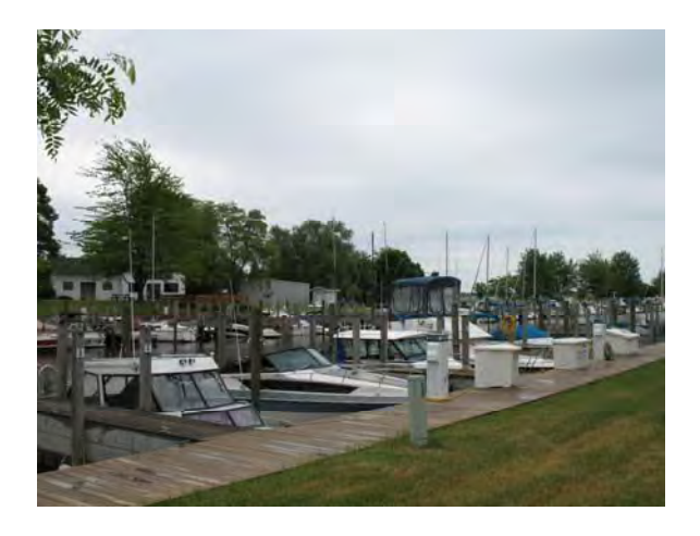
350 Cihak Street, North Muskegon Pointe Marina Association