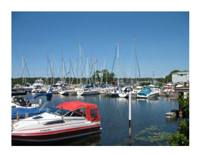
302 S. Lake, Whitehall Crosswinds Marina

Lake and First Streets, Whitehall Utility Building near Trestle Bridge