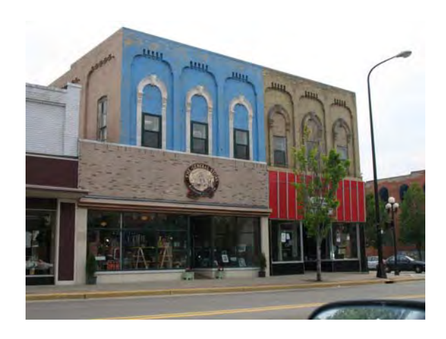
103 E. Colby, Whitehall The General Store