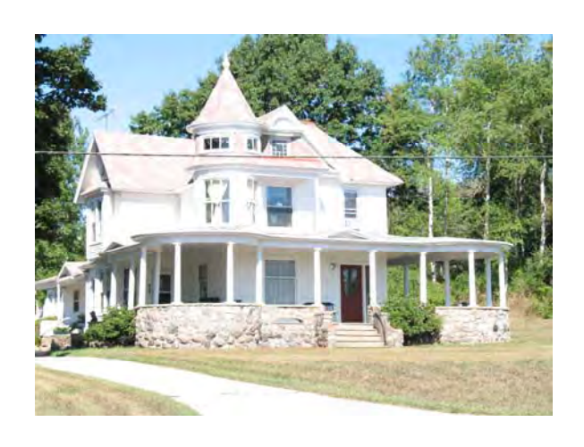
Oceana Drive, Rothbury Queen Anne Residence

This local meat market was established around 1950.