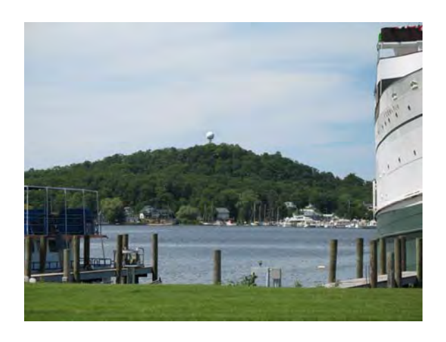
Lake Kalamazoo, Blue Star Highway, Saugatuck View of Mt. Bald Head