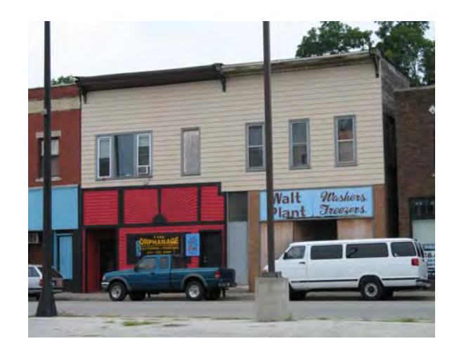
1125 Third Street, Muskegon Orphanage Tatoo and Walt Plant Building