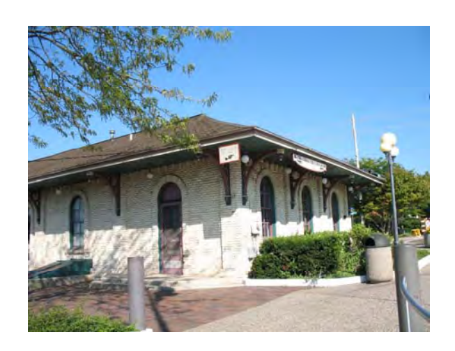
1 North Harbor, Grand Haven Tri-Cities Museum

The railroad depot was built by the Grand Trunk Railroad in 1870.