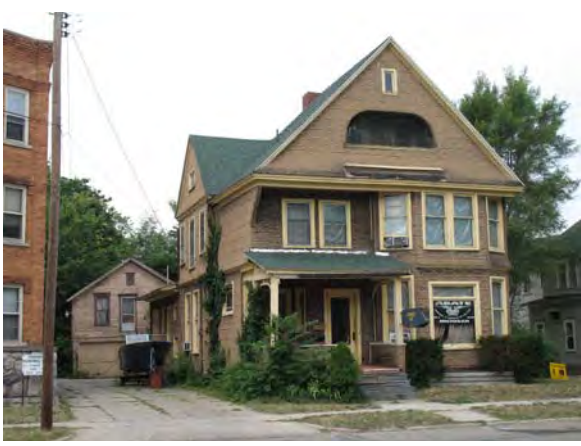
1239 Peck Street, Muskegon Sherman's Apartments