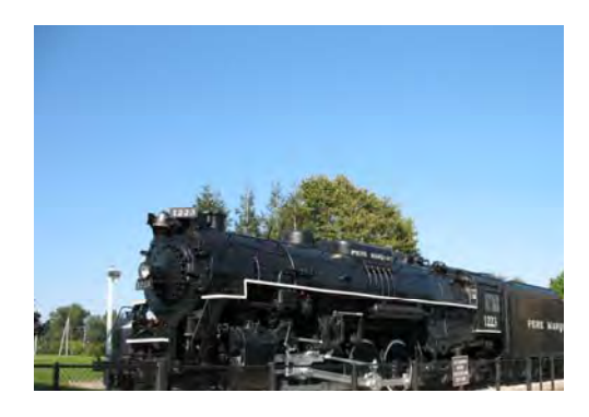
N. Harbor Drive, Grand Haven Shay Locomotive

The Shay Locomotive was built in 1882 and served the Cutler and Savidge Lumber Company.