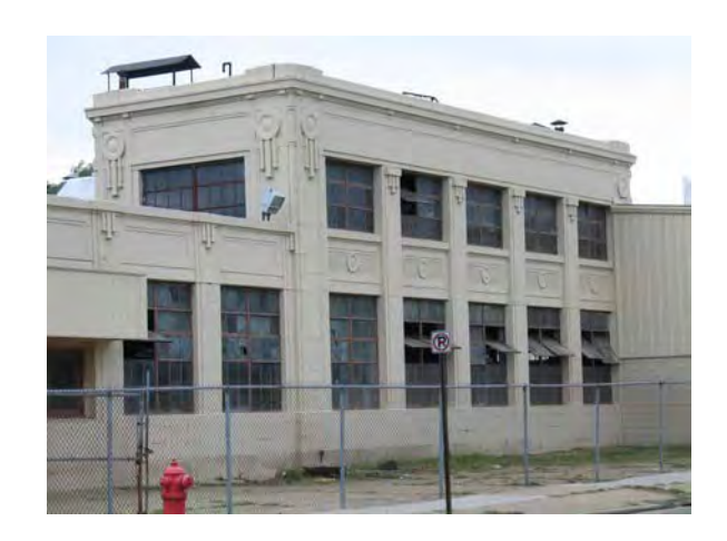
1901 Peck Street, Muskegon Dymet Corporation

A classic neon "Eat" sign at the site of a former restaurant.