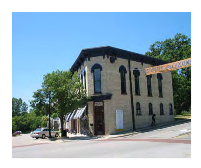
8701 Ferry, Montague White River Gallery