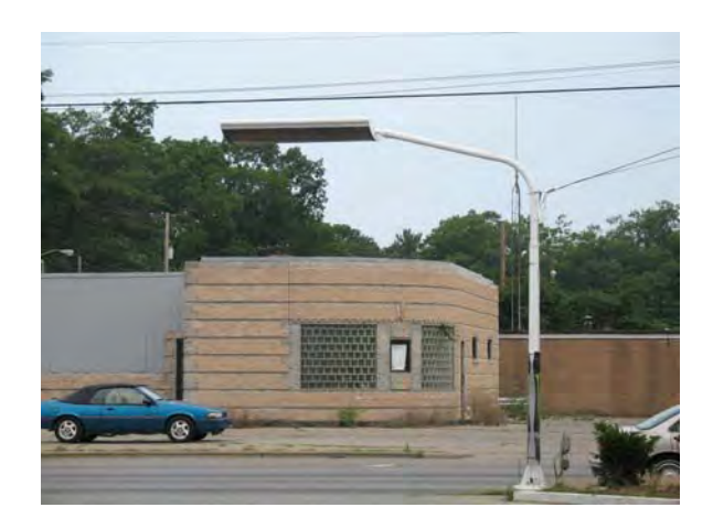
N. W. Corner Peck Street at Sherman, Muskegon Heights Art Moderne Commercial Building