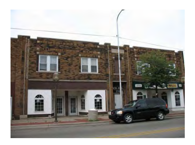
2715 Peck Street, Muskegon Heights Noel Block