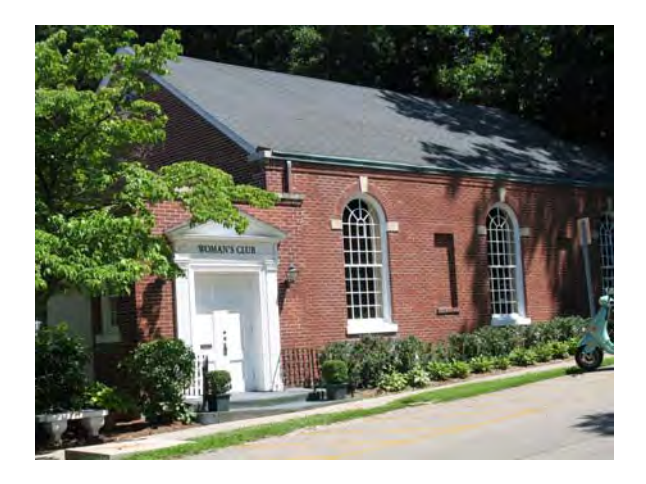
303 Butler Street, Saugatuck Women's Club

In 1926 architect Carl Hoerman redesigned the Village Hall in the Colonial Revival style as part of an effort to increase Saugatuck's appeal as a tourist destination.