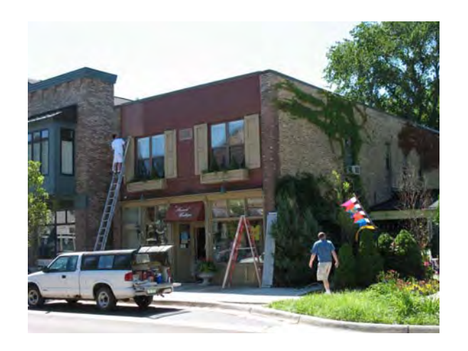
33 Center Avenue, Douglas French Cottage