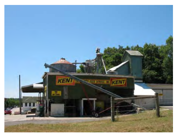
8819 Ferry, Montague Tri-County Feed Service

The feed service was established in 1951.