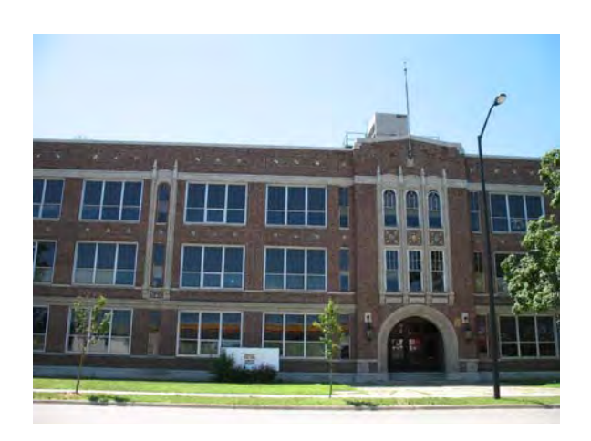
Sixteenth and River Streets, Holland Holland High School