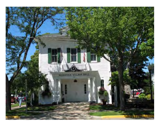
102 Butler Street. Saugatuck Saugatuck Village Hall

On August 19, 1899, the Holland and Lake Michigan Railroad Company began service to Saugatuck. The service connected Saugatuck to the city of Holland and the resorts on Lake Macatawa.