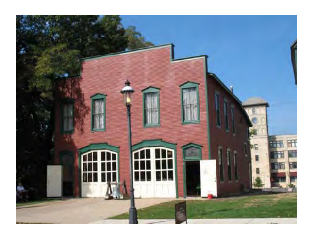
502 W. Clay, Muskegon Fire Museum

This firehouse is a re-creation of the original Hackley House Company #2 that operated in Muskegon between 1875 and 1892. The re-created firehouse was built in 1976 during the Bicentennial.