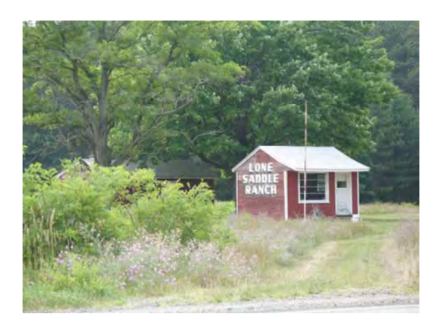
Lone Saddle Ranch Sign, Whitehall Whitehall Road