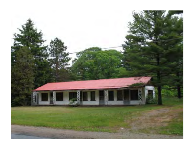
Scenic Drive, Muskegon Rustic Lantern Motel

The farmhouse and two six-room motel units, located just north of Pioneer County Park, are reminders of how tourism and the construction of the highway changed the economy of Muskegon County. The current owner replaced the asphalt roof with tin to preserve the resource. He is interested in rehabilitating the buildings.