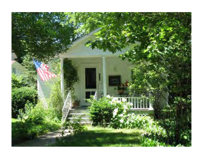
724 Holland, Saugatuck Residence