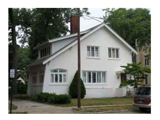
Peck Street, Muskegon Craftsman Bungalow