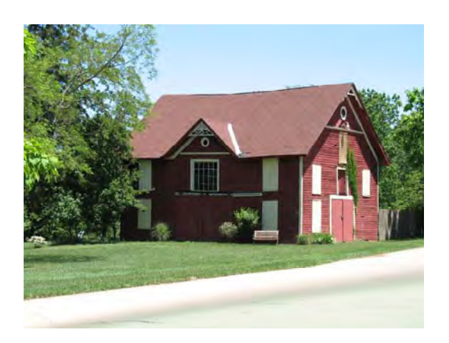
Blue Star Highway, Ganges Township Barn