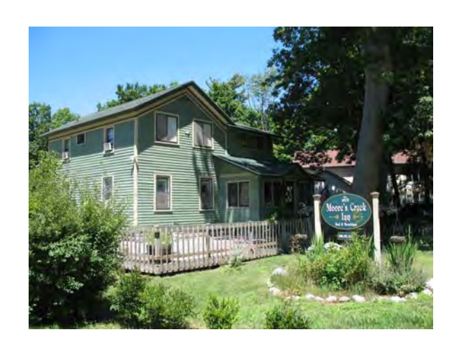
820 Holland, Saugatuck Moore's Creek Inn