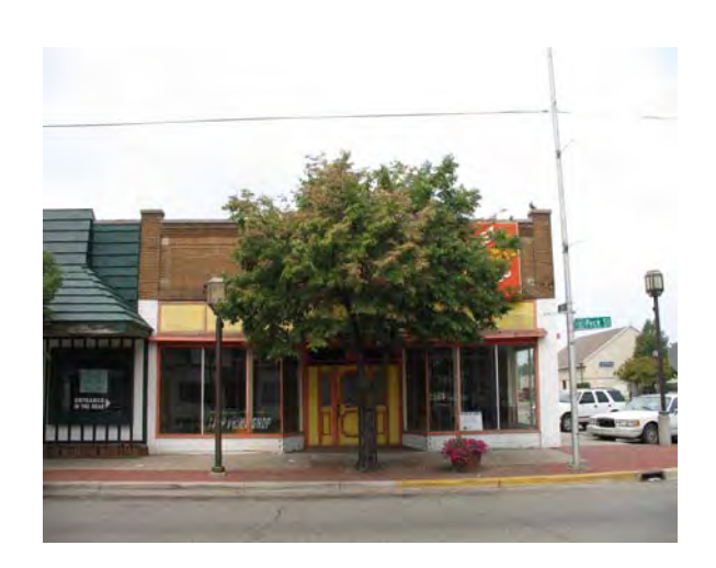
2700 Block of Peck Street, Muskegon Heights Commercial Building