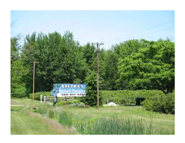
Blue Star Highway Krupka's Blueberry Plantation