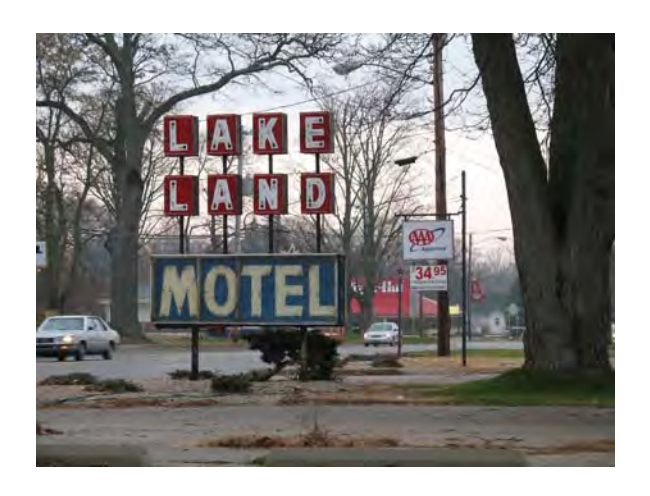
1002 E. Colby, Whitehall Lakeland Motel