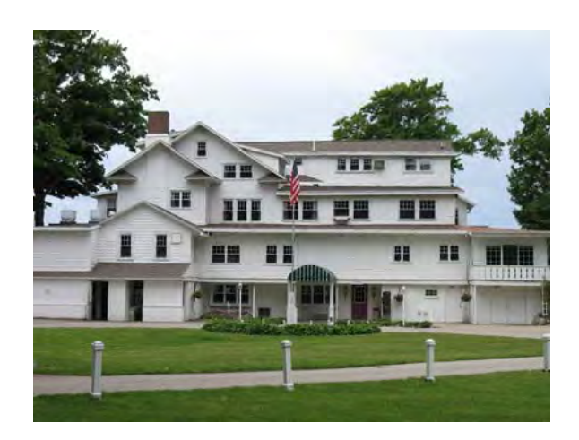
5207 Scenic Drive, Muskegon Michilinda Resort

Known as the Michilinda Pines Resort in 1890, the historic inn has undergone extensive remodeling. The landscape still retains its turn of the century feeling and features.