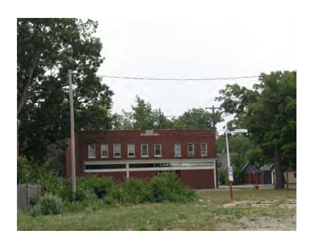
Peck Street, Muskegon The Christansen Building

A commercial building constructed in 1913.