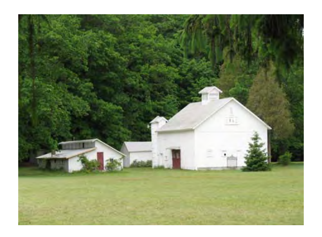
South Shore Drive, Whitehall Farm Buildings

An estate built in 1904 in the Craftsman style.