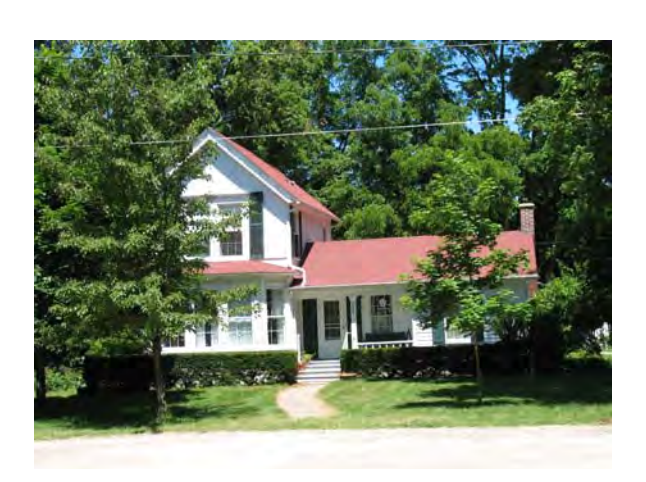
290 Francis, Saugatuck Residence