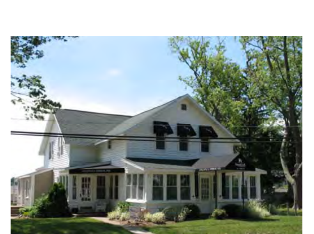
787 Lake Street, Saugatuck Saugatuck Harbor Inn

Built in the 1940s, this was a popular post World War II