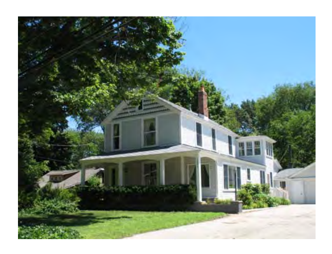
1036 Holland, Saugatuck Residence