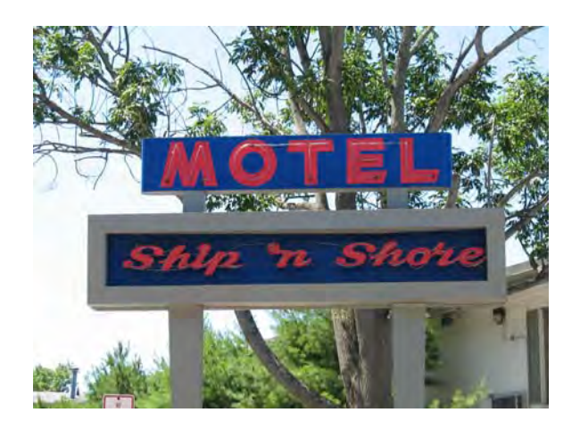
Ship 'n Shore Motel-Boatel, Saugatuck 528 Water Street

This motel built in the 1960s is in a location that allows boaters to dock in front of their rooms.