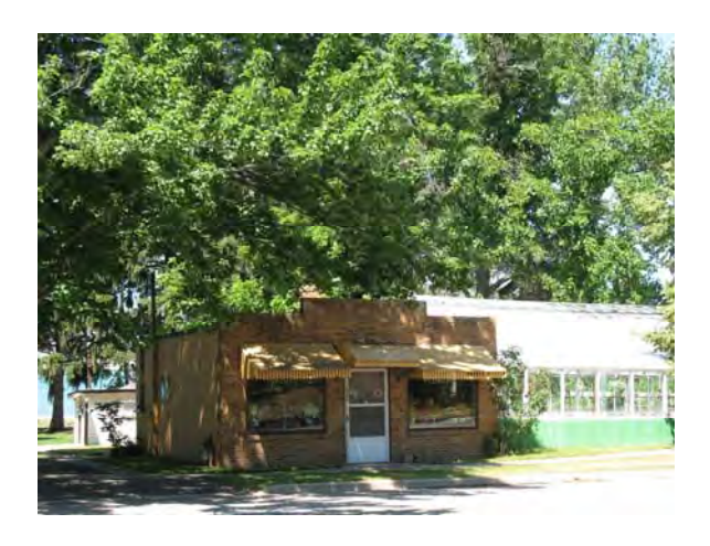
500 block S. Mears, Whitehall Florist