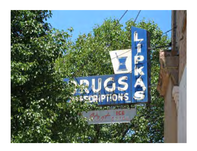
8718 Ferry Street, Montague Lipka's Soda Fountain (Lipka's Drugs)

Established in 1946 as a drug store and soda fountain by Glen Lipka, it was converted into a restaurant and soda fountain in 2002 by the Lipka family.