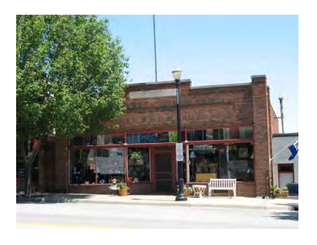
4574 Dowling, Montague Page's LLC

The Ohrenberger Block was built in 1930.