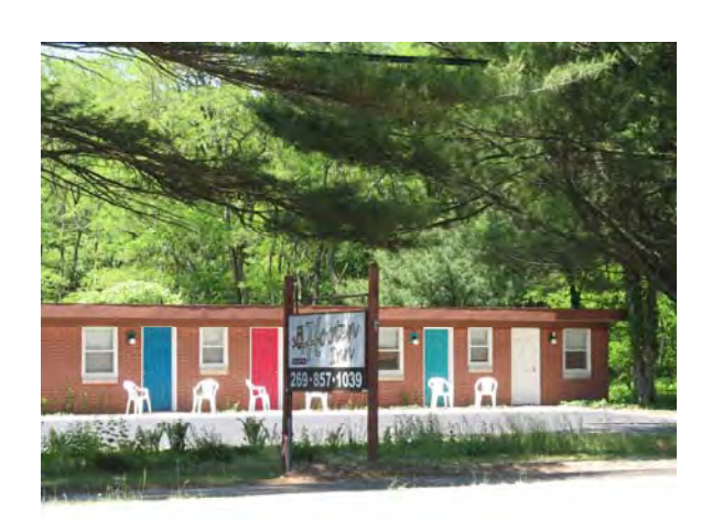
6541 Blue Star Highway, Saugatuck Hooten Inn