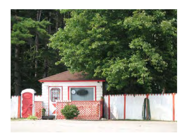
Whitehall Road, Whitehall