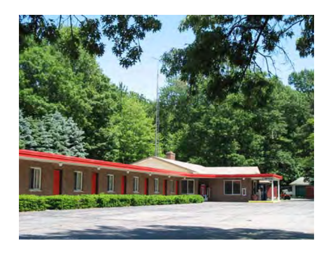
3353 Blue Star Highway, Saugatuck Timberline Motel