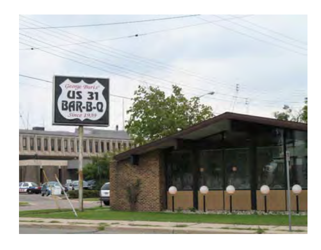
151 W. Muskegon Avenue, Muskegon U.S. 31 Bar-B-Q

The church was founded in 1875 by Swedish and Finnish immigrants.