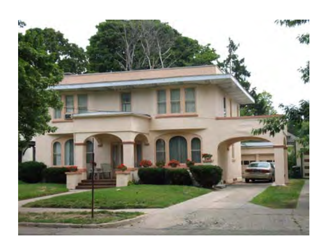
Peck Street, Muskegon Residence