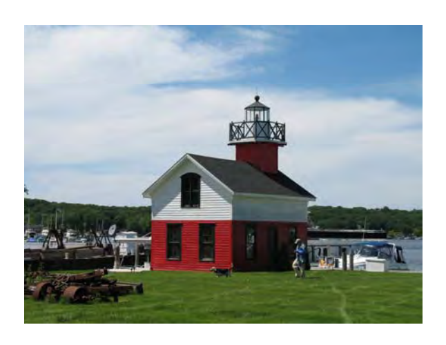
Lake Kalamazoo, Blue Star Highway, Saugatuck Replica Lighthouse

A 1907 passenger ferry that was once operated by the Canadian Pacific Railway on the Georgian Bay and Upper Lake Superior. The ship was retired in 1965 and moved to Sauagtuck in 1967. The ship is anchored at what was known as the Red Dock, a former fruit shipping port for local farmers.