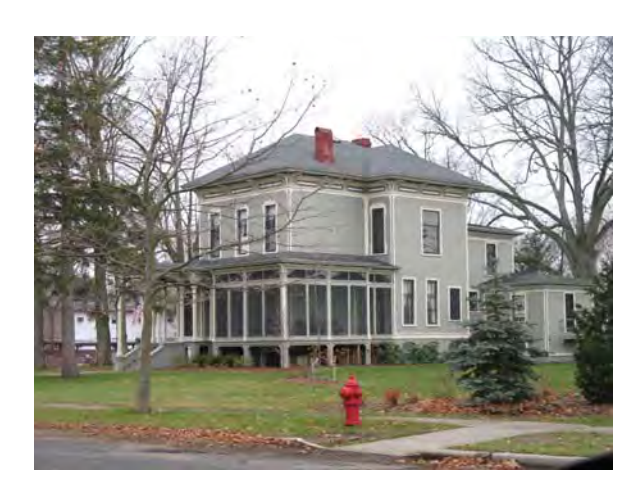
Old Channel Trail, Montague Italianate Cottage