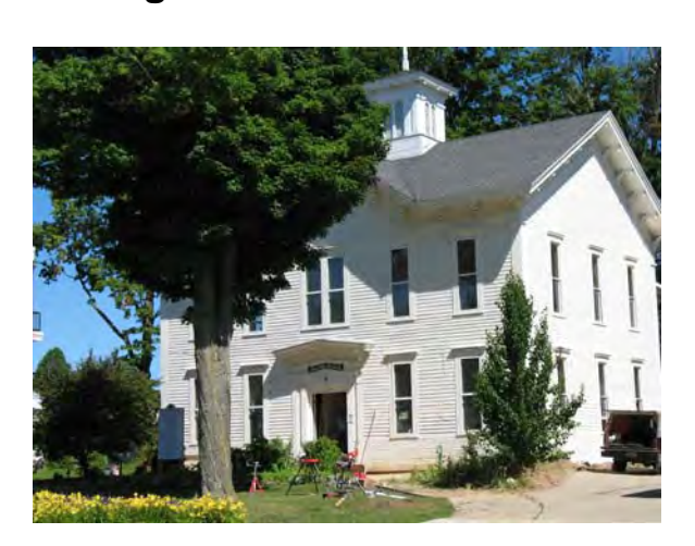
Center Avenue, Douglas Douglas Union School