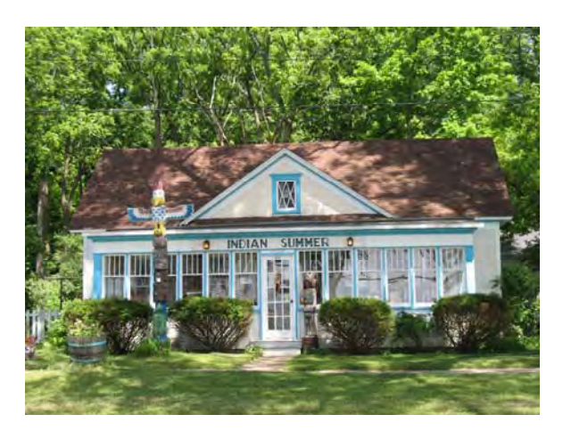
800 Lake Street, Saugatuck Indian Summer