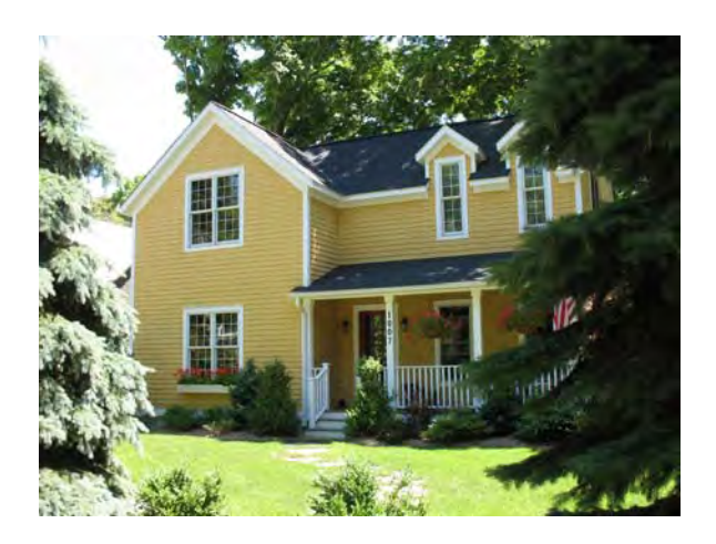
1007 Holland, Saugatuck Residence