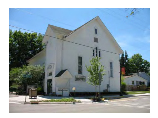
137 Center Avenue, Douglas Saugatuck Douglas Library