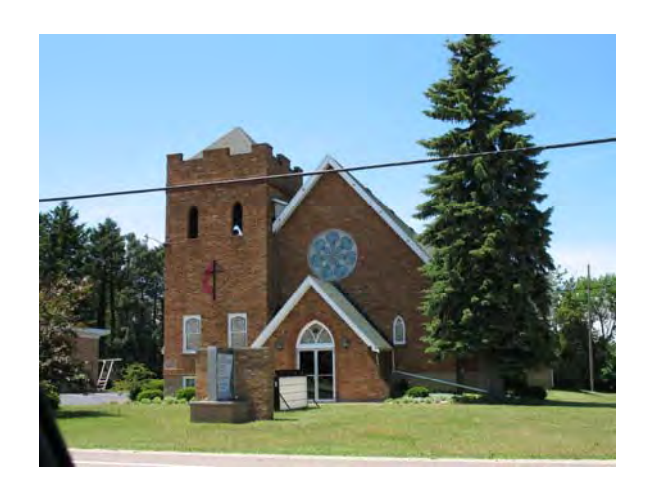
Blue Star Highway, Ganges Township Church