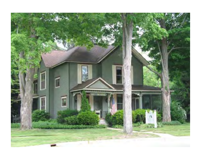
303 S. Mears, Whitehall White Swan Inn