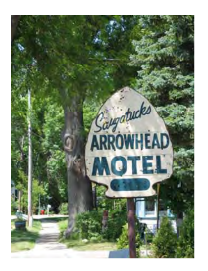
842 Lake Street, Saugatuck Arrowhead Resort

Built in the 1940s, this was a popular post World War II