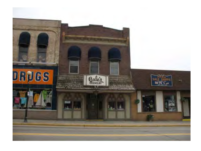
105 W. Colby, Whitehall Gale's Jewelry