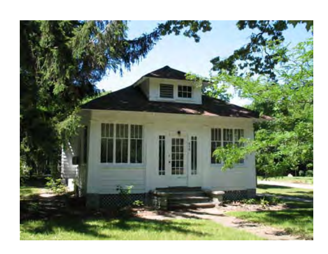
650 Holland, Saugatuck Residence

Maple trees were planted along roadsides in communities across America during the nation's bicentennial in 1876. The idea came from a tree planting program initiated for the Centennial Expostion held in Philadelphia.