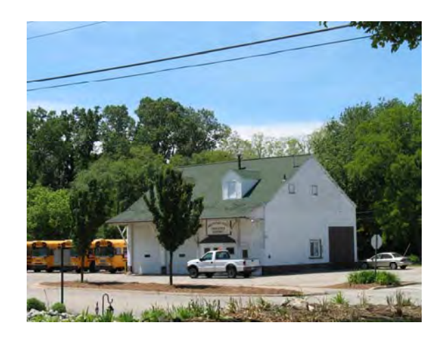
Saugatuck School Bus Garage Blue Star Highway, Douglas