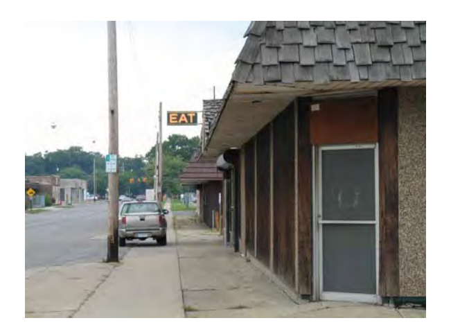
1928 Peck Street, Muskegon Commercial Strip

A classic neon "Eat" sign at the site of a former restaurant.