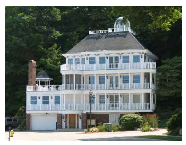
S. Shore Drive, Holland Delft House Reconstruction

Established in 1910 as the Jesiek Brothers Boat Yard, the original boat works burned and was rebuilt in 1915 on what is now the site of the Eldean Marina. During World War II, the boat works was leased to the Victory shipbuilding company who built submarine chasers for the military.