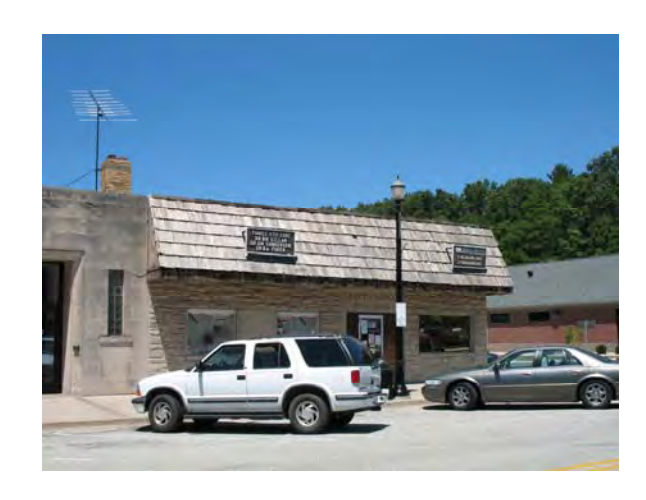
8747 Ferry Street, Montague Professional Building