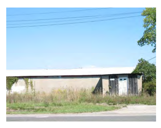
7200 Grand Haven Road, Grand Haven Agricultural Building