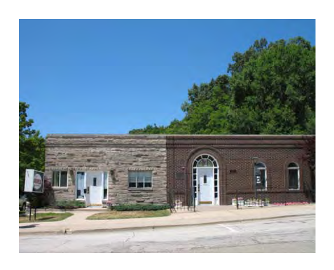
8779 Ferry Street, Montague The Arrowhead Agency (Far right)