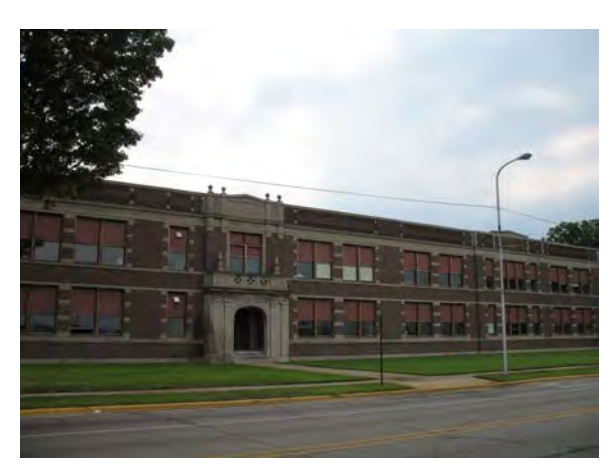
Peck Street @ Sherman, Muskegon Heights Central School