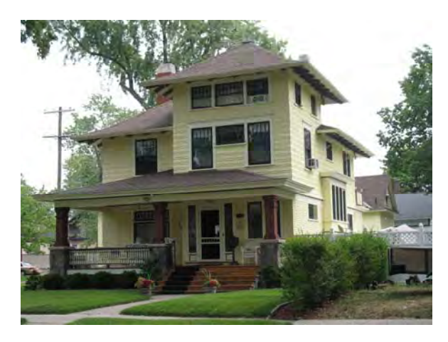
1562 Peck Street, Muskegon Residence

This Art Moderne style building was originally an apartment complex.