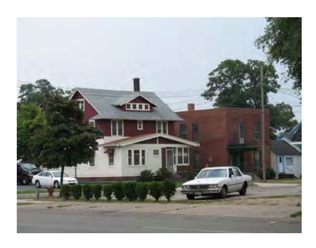
Peck Street, Muskegon

A commercial building constructed in 1913.