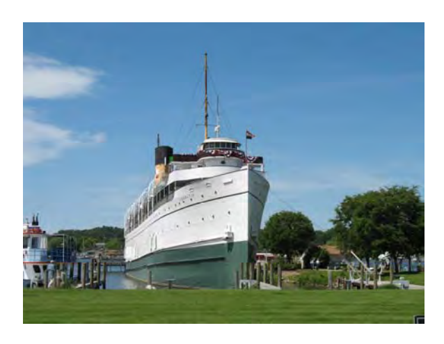
Lake Kalamazoo, Blue Star Highway SS Keewatin

Originally the Plaza Tourist Court, a 1950s era motel with little decoration, the motel was completely remodeled in 2004 to reflect the Arts and Crafts style.