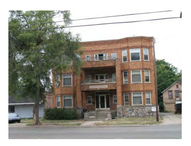
Peck Street, Muskegon Kensington Apartments