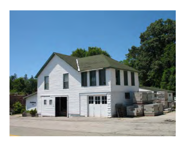
8789 Ferry, Montague Ramthun Building Materials