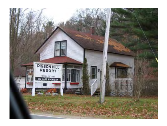
7147 Old Channel Trail, Montague Pigeon Hill Resort